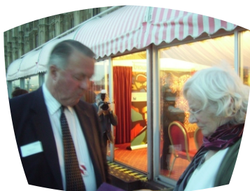
Candida impresses Lord Geddes